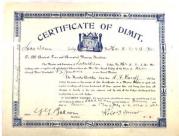
MY LODGE WANTS ME TO RESIGN November 9, 2021