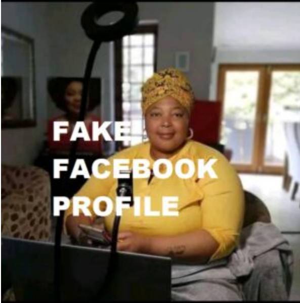
SNAPPED! November 27, 2021