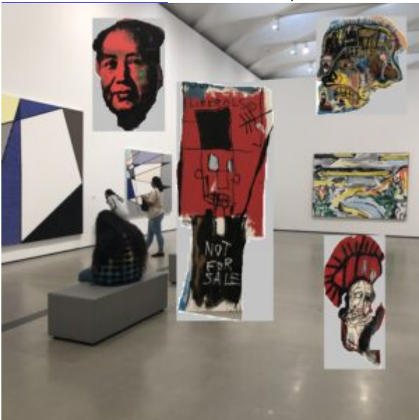
NOT FOR SALE December 4, 2021