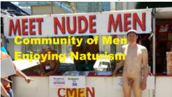
A BLOGGER IS ALWAYS VIGILANT December 3, 2021