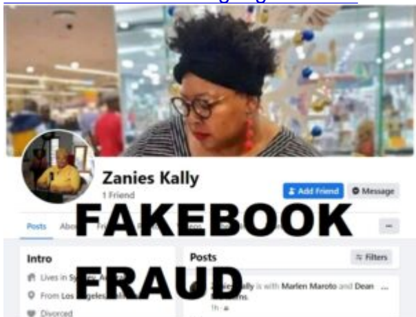
MY CALLING IS TO EXPOSE FRAUD November 29, 2021