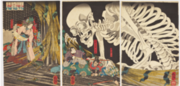
A Hungry Ghost is Never Satisfied November 17, 2021