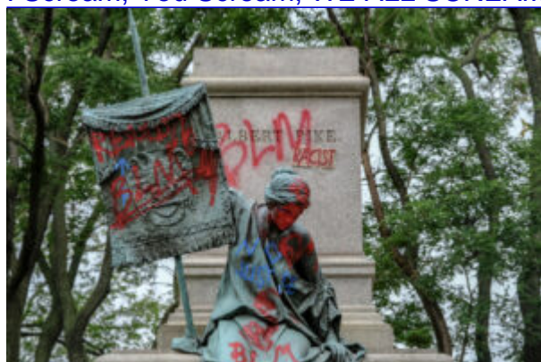
Accidental Confederate General in Washington: CANCELING ALBERT PIKE November 11, 2021