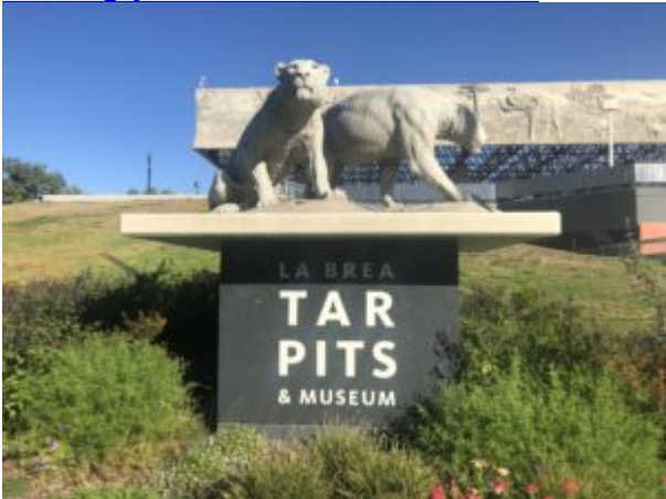
THE PITS November 16, 2021