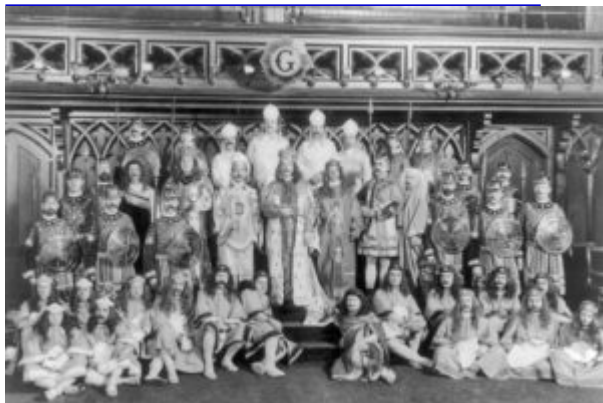
CAN YOU GET KICKED OUT OF FREEMASONRY? November 8, 2021