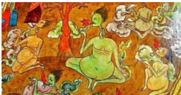
I AM A HUNGRY GHOST December 1, 2021