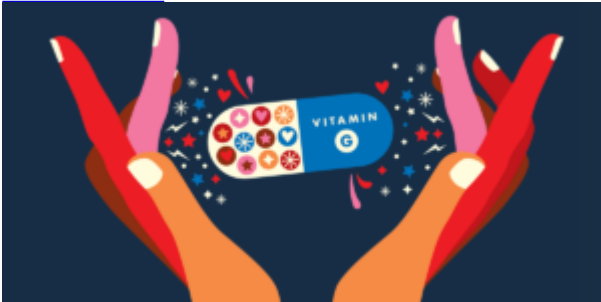
HAVE YOU TAKEN YOUR RECOMMENDED DAILY DOSE OF VITAMIN G THIS MORNING? November 24, 2021