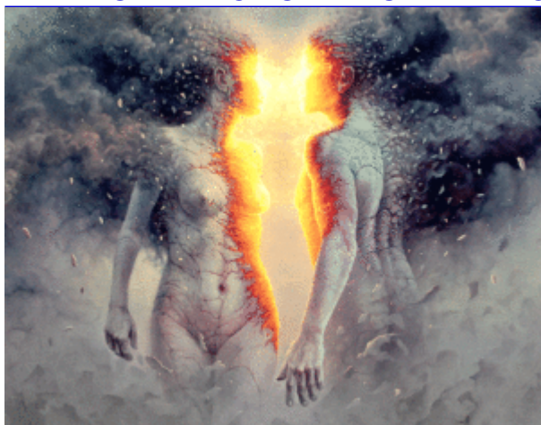
Attunement is the Language of Love November 30, 2021