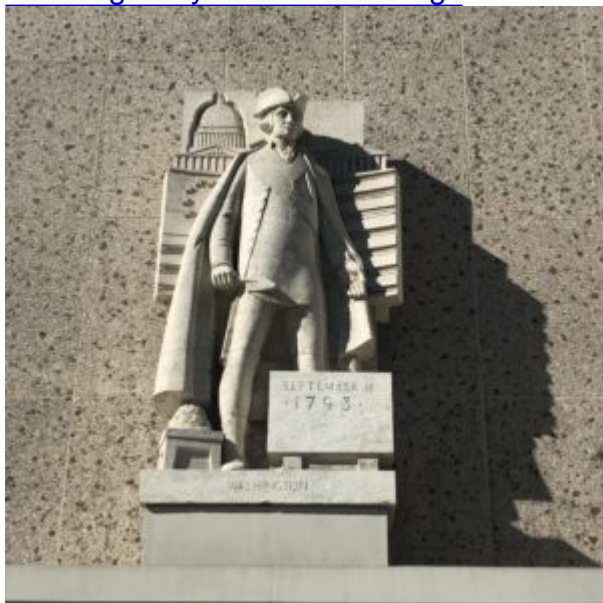
Why did I become a Freemason? BECAUSE GEORGE WASHINGTON WAS A MASON! November 14, 2021