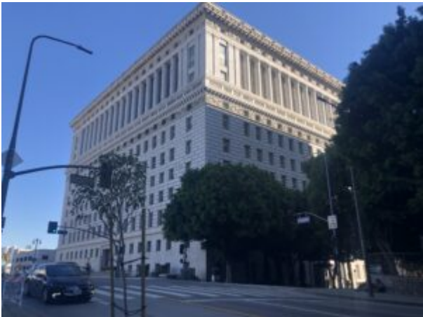
LOCKED UP November 23, 2021