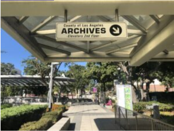
GET THE MONEY! November 22, 2021