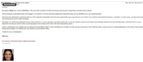
DO NOT REPLY December 5, 2021