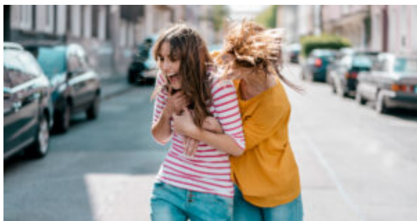
Your Brain Releases Dopamine from Hugs or Drugs November 16, 2021