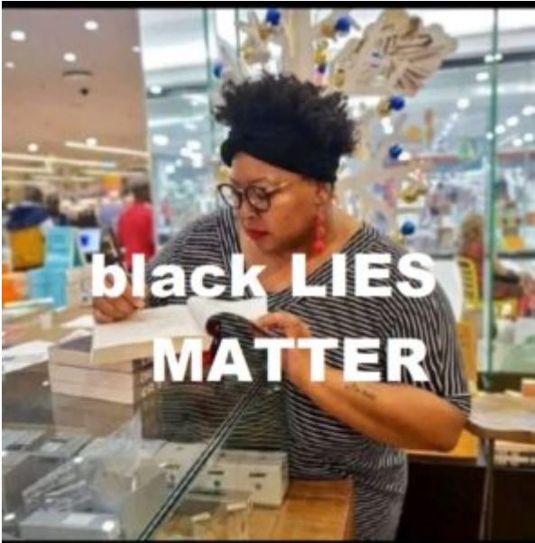
I MAY DESTROY YOU November 28, 2021