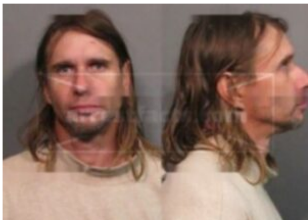
WEST COAST GATHERING OF WRONGNESS December 18, 2021