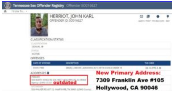
CITIZEN OVERSIGHT December 26, 2021