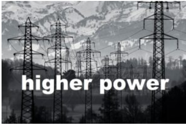
HIGHER CONSCIOUSNESS December 15, 2021