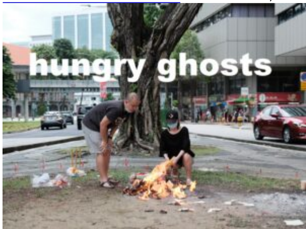
DESTRUCTION OF TRADITIONAL CULTURE CONTRIBUTES TO DRUG ADDICTION December 8, 2021