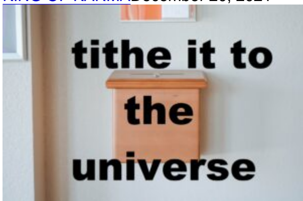
tithe to thrive December 19, 2021