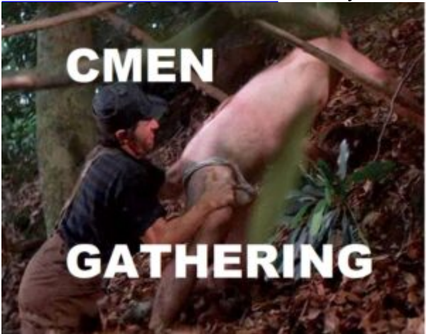
SEMEN GATHERING January 14, 2022