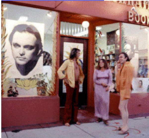
The man of understanding is not entranced December 14, 2021