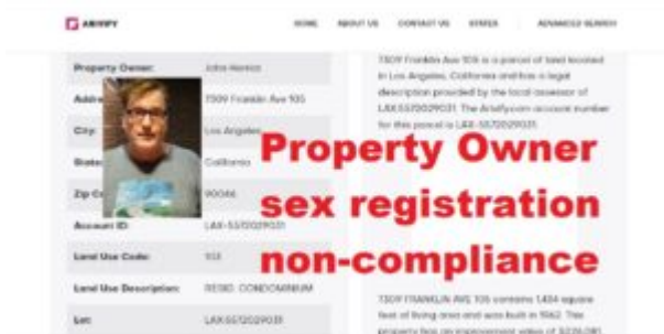
JUSTICE WARRIOR December 21, 2021