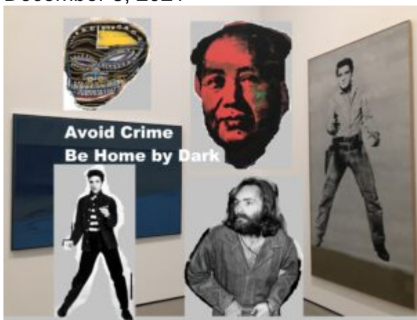
AVOID CRIME: Make Art, Not Social Media December 7, 2021