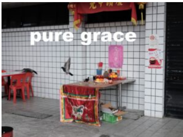
THERE IS A SOLUTION December 9, 2021