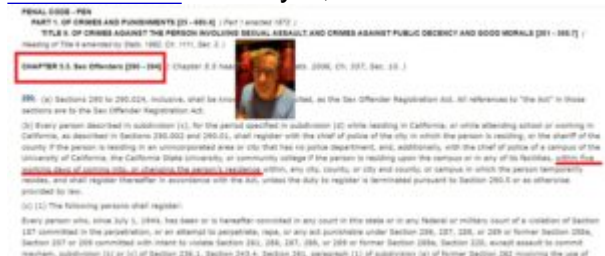
HERRIOT'S CURRENT PENAL CODE VIOLATIONS January 1, 2022