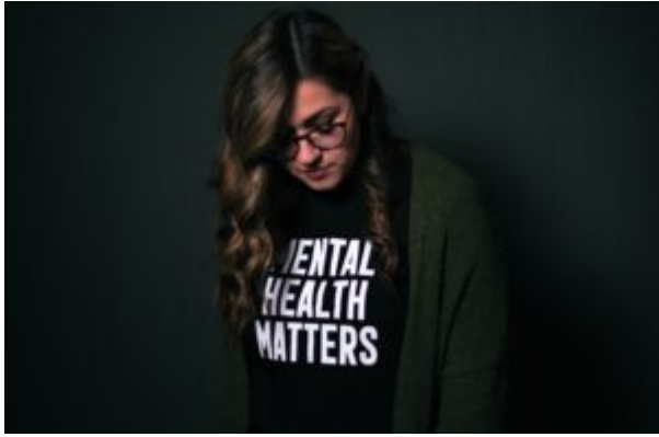
Resentment is soul suicide December 12, 2021