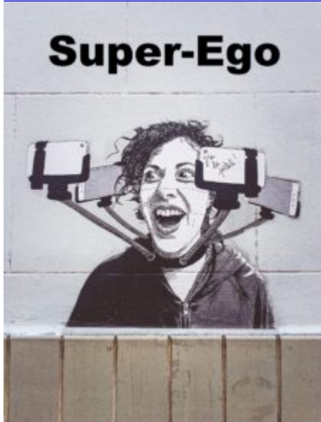
EGO December 16, 2021