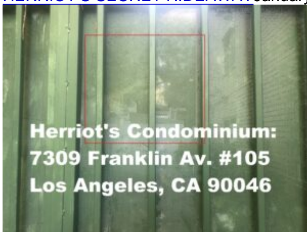
HERRIOT'S SECRET HIDEAWAY January 10, 2022

Herriot's Condominium: 7309 Franklin Av. #105 Los Angeles, CA 90046