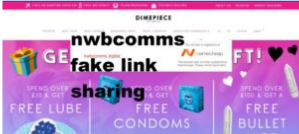
DO NOT REPLY December 5, 2021

Date Created December 2021 Author deanmcadams