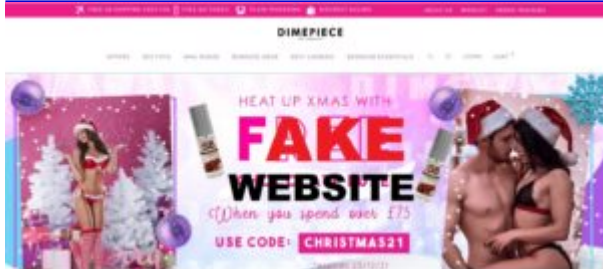
AVOID MALWARE, START A FRESH EMAIL THREAD December 6, 2021