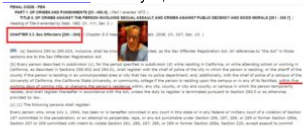
HERRIOT'S CURRENT PENAL CODE VIOLATIONS January 1, 2022