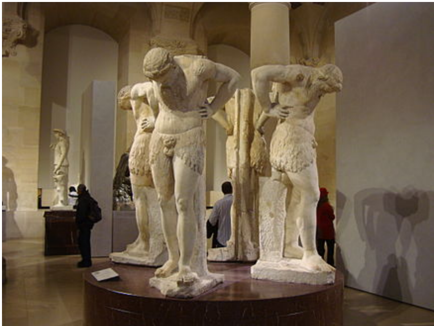
Four statues of navel gazers at the Louvre

In the middle of a heat wave I was sitting in the library reading the news on my iPhone while waiting for the maid to finish cleaning my apartment. One of the elderly gay brothers walked by and jocularly quipped: “ What are you doing, gazing at your navel? ” “Yes” I succinctly replied to the gentleman as I thought to myself, I am gazing at my navel in public while fully clothed and I can’t wait to get back to my apartment to further contemplate various parts of my body.