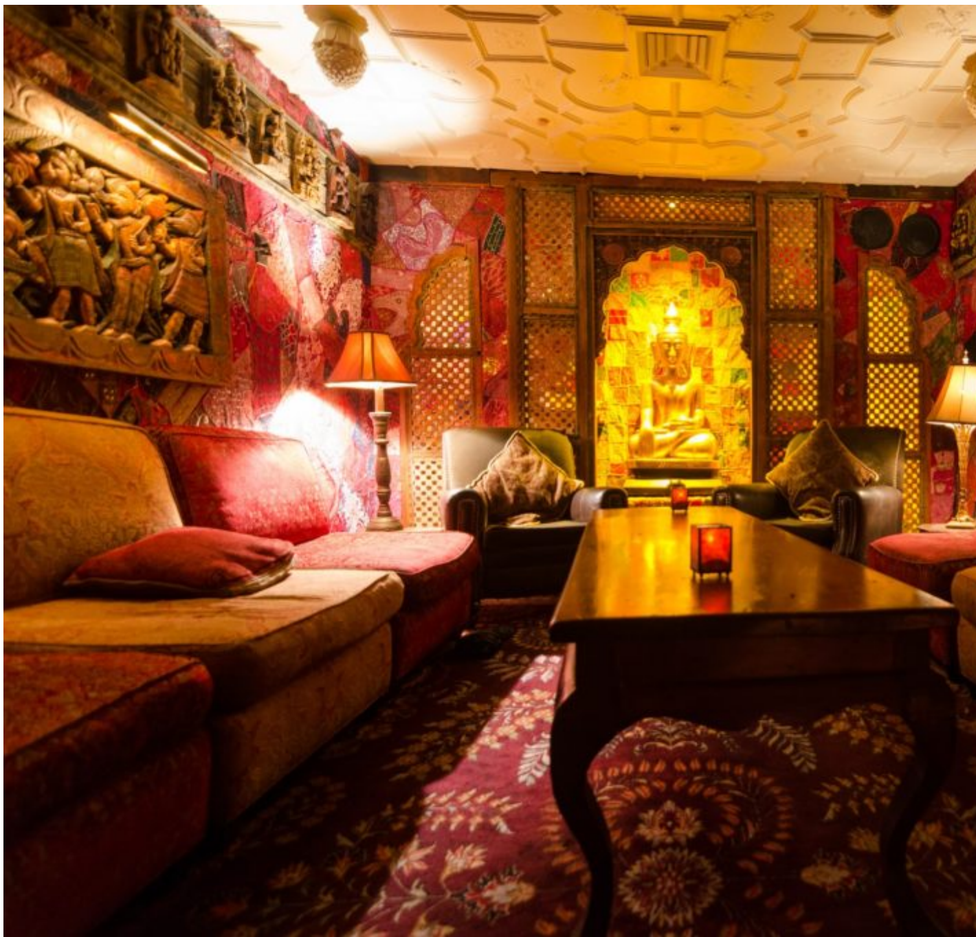
Foundation Room – House of Blues – Chicago

The House of Blues and all nightclubs & music venues may be closed due to the Great Lock-Down but that has not stopped the zeitgeist from addressing this current hot topic of inequality. We don't have statues of Jesus and Mary rocking out at the House of Blues do we? Do nightclubs in Buddhist countries contain statues of Jesus? No, and therefore we shouldn't have the Buddha Bar in America just because American club-goers do not venerate Buddha like Buddhist people do.