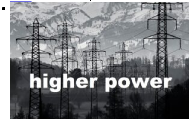
HIGHER CONSCIOUSNESS December 15, 2021