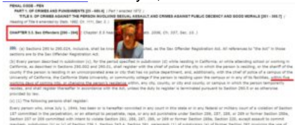
HERRIOT'S CURRENT PENAL CODE VIOLATIONS January 1, 2022