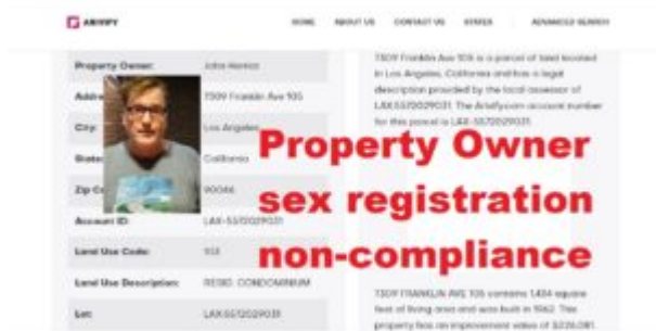
JUSTICE WARRIOR December 21, 2021