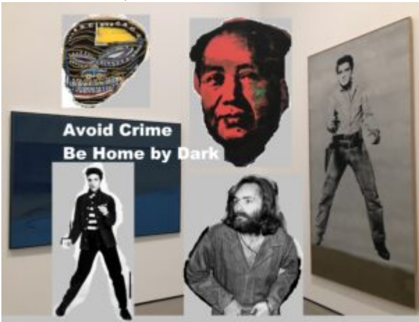
AVOID CRIME: Make Art, Not Social Media December 7, 2021