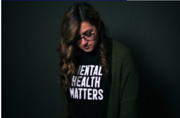
Resentment is soul suicide December 12, 2021