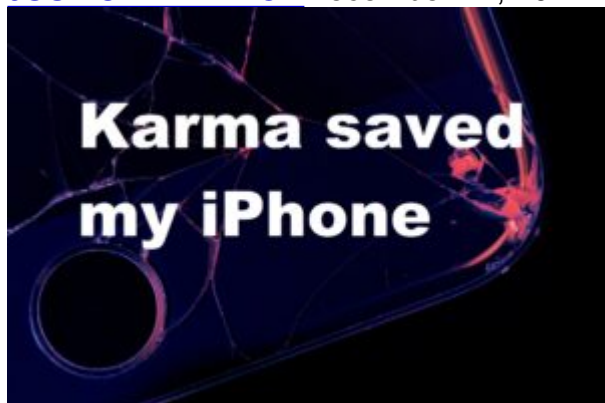
KING OF KARMA December 20, 2021