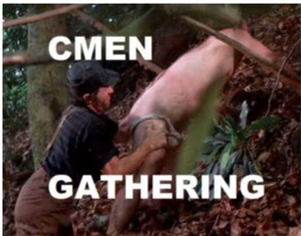
SEMEN GATHERING January 14, 2022