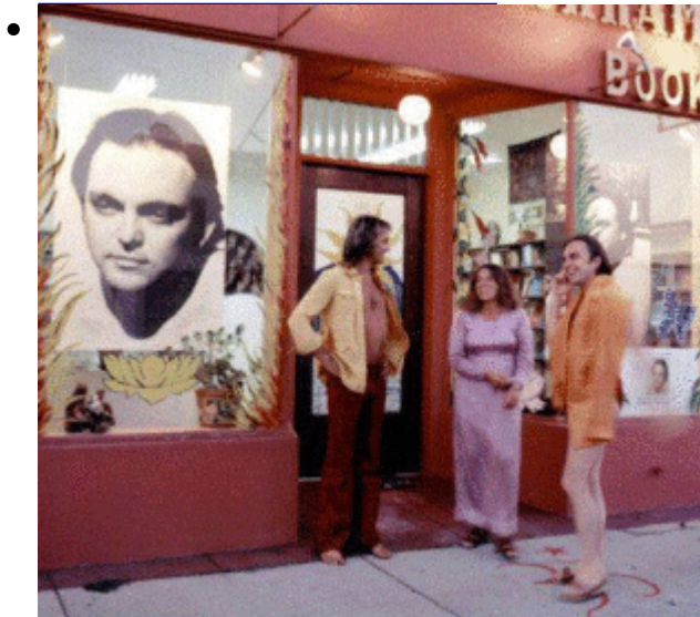
The man of understanding is not entranced December 14, 2021