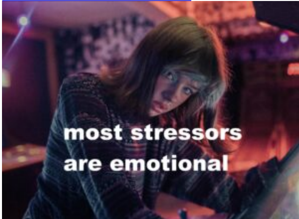
MINDFULNESS MATTERS December 11, 2021