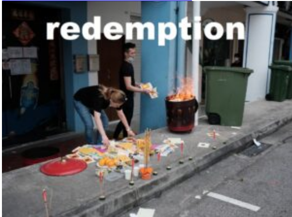
inner causes December 10, 2021