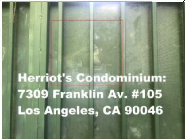
GUM SHOE January 3, 2022