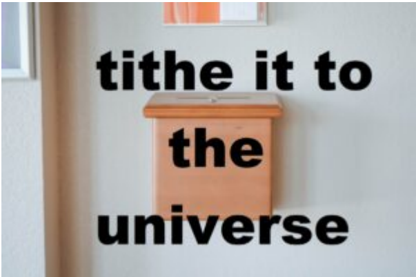
tithe to thrive December 19, 2021