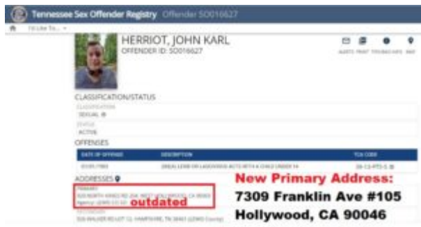
CITIZEN OVERSIGHT December 26, 2021