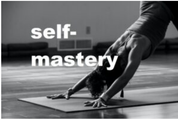
Self-mastery is self-motivated December 13, 2021