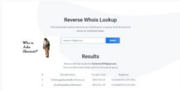
INDUSTRIAL PEDOPHILIA January 19, 2022