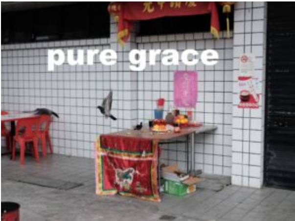
THERE IS A SOLUTION December 9, 2021