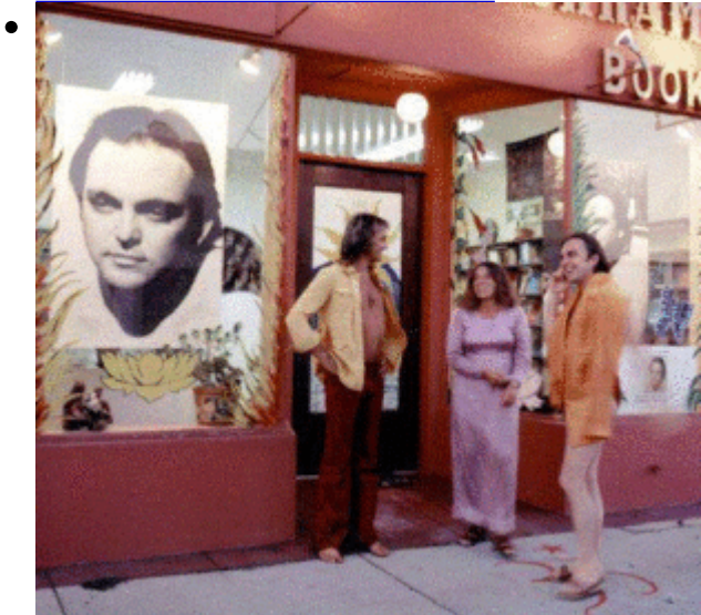
The man of understanding is not entranced December 14, 2021