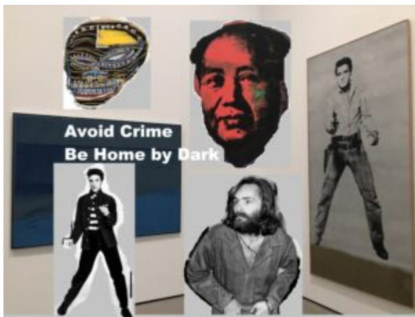
AVOID CRIME: Make Art, Not Social Media December 7, 2021