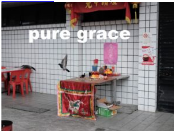
THERE IS A SOLUTION December 9, 2021