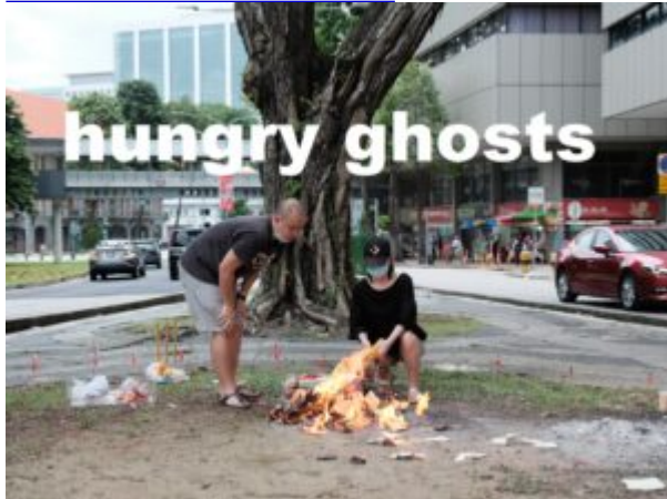
DESTRUCTION OF TRADITIONAL CULTURE CONTRIBUTES TO DRUG ADDICTION December 8, 2021