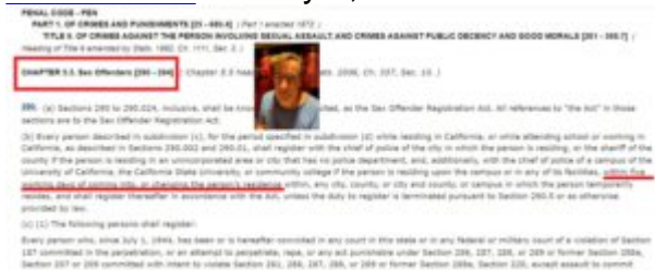
HERRIOT'S CURRENT PENAL CODE VIOLATIONS January 1, 2022