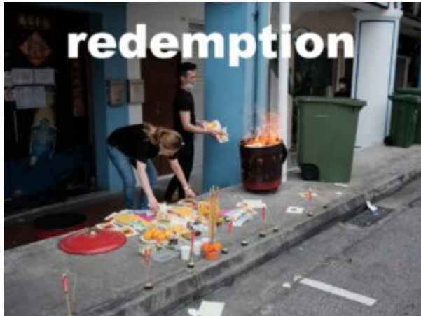
inner causes December 10, 2021