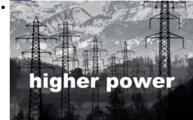
HIGHER CONSCIOUSNESS December 15, 2021