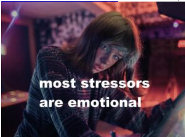
MINDFULNESS MATTERS December 11, 2021